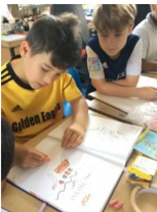
Exploring different hair textures through different media.

'In art we have discovered how different we are not just in the way we look but our special personalities.' By Wilfred